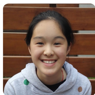
by Nicole Qian, 13 Auckland, NZ