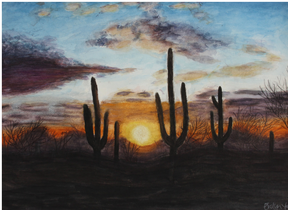
Saguaros at Sunset , watercolor